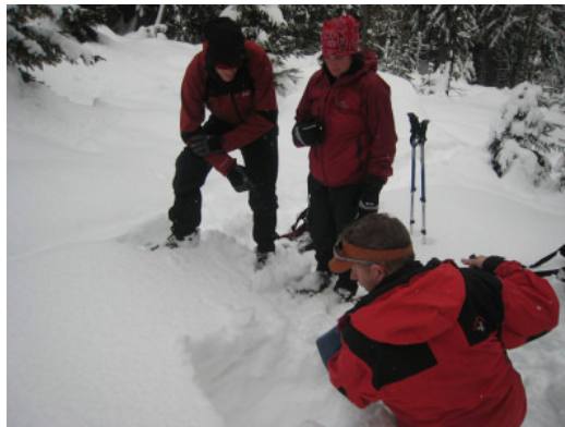
digging a snowpit